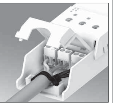
The cable must be fastened with standard cable ties (width <3,6 mm).