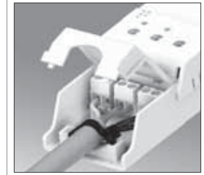
The cable must be fastened with standard cable ties (width <3,6 mm).